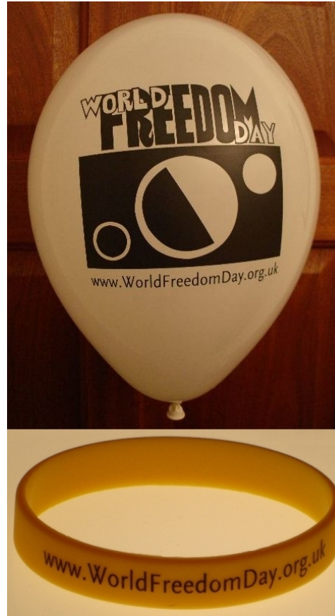
World Freedom Day balloons and wristbands